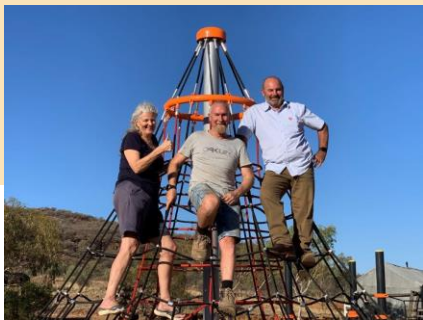
Celebrating Hamilton Downs new playground